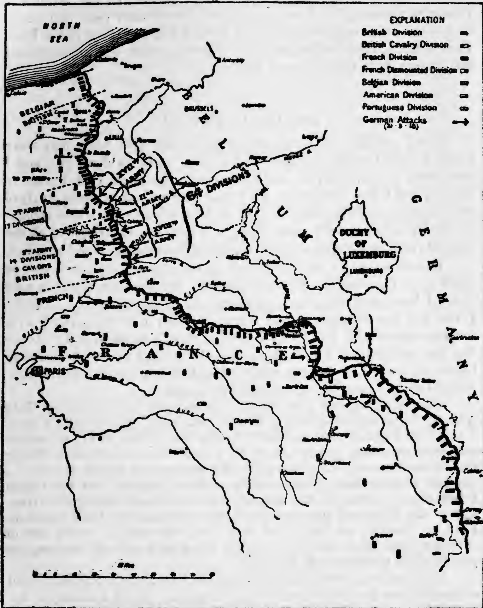
Position on the Western Front, third week of March, 1918.